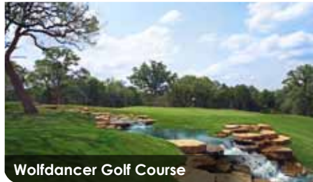
Wolfdancer Golf Course

Get a jump start on your networking by playing a round of golf with in-house counsel, speakers and sponsors. This year's tournament at the Hyatt Lost Pines' Wolfdancer Golf Club